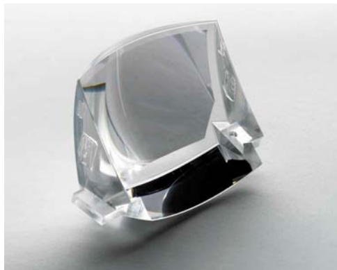
Lightweight and low cost eMagin's WFO5 Prism Optic delivers field of view of nearly 40 deg with >60% light throughput.

The WFO5 optic is available as an individual component or sealed to an eMagin OLED microdisplay as the basis for a compact display system.